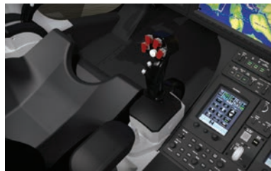
DIGITAL FLY-BY-WIRE CONTROLS