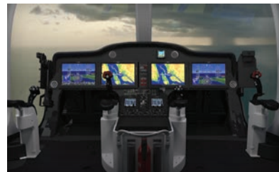
ARC HORIZON® FLIGHT DECK