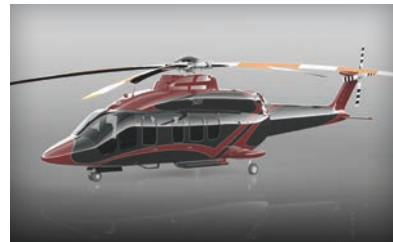
BELL 525 RELENTLESS EXTERIOR

Max GW, 6Kft ISA+20, OGP configuration, standard tank, CAT A w/JAROPS fuel reserves, 255lb pax wt