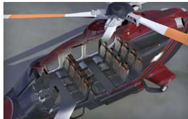
16 PASSENGER CONFIGURATION